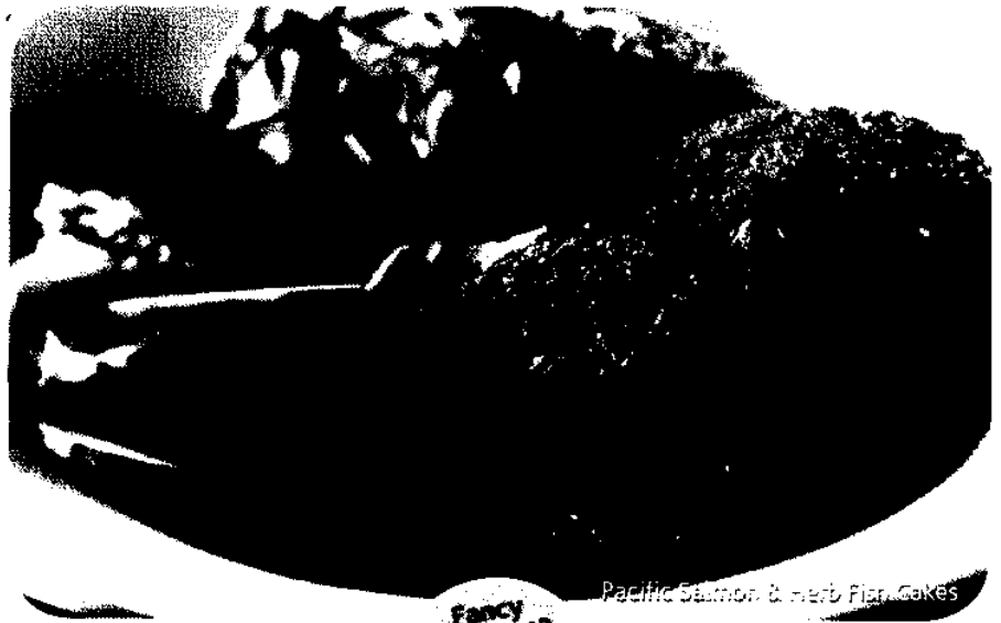
Pacific Salmon & Herb Fish Cakes

Fancy a dessert? Turn over to see our delicious selection!