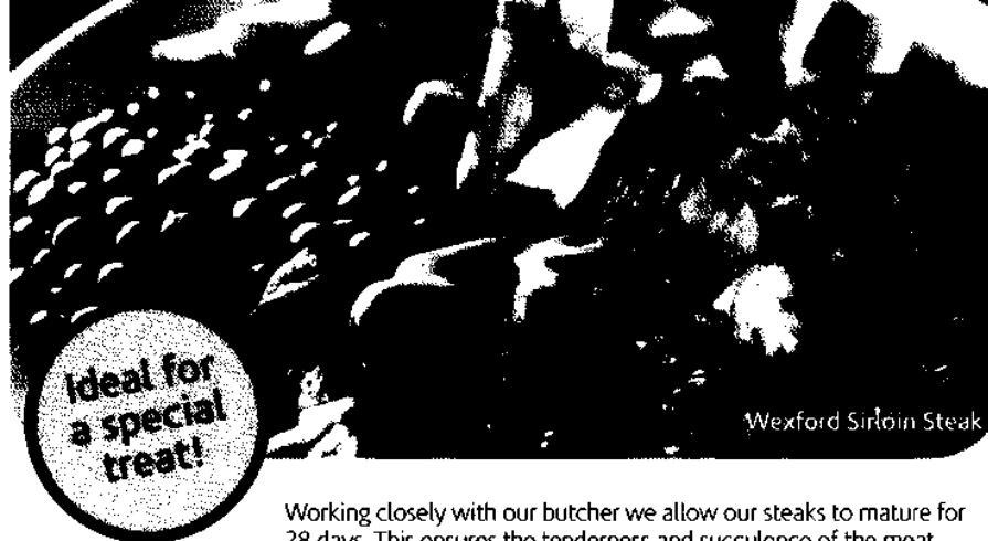
Wexford Sirloin Steak

Working closely with our butcher we allow our steaks to mature for 28 days. This ensures the tenderness and succulence of the meat, giving a rounder, fuller flavour.