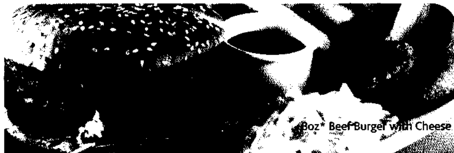
Boz* Beef Burger with Cheese

Turn over for our range of sandwiches & baguettes