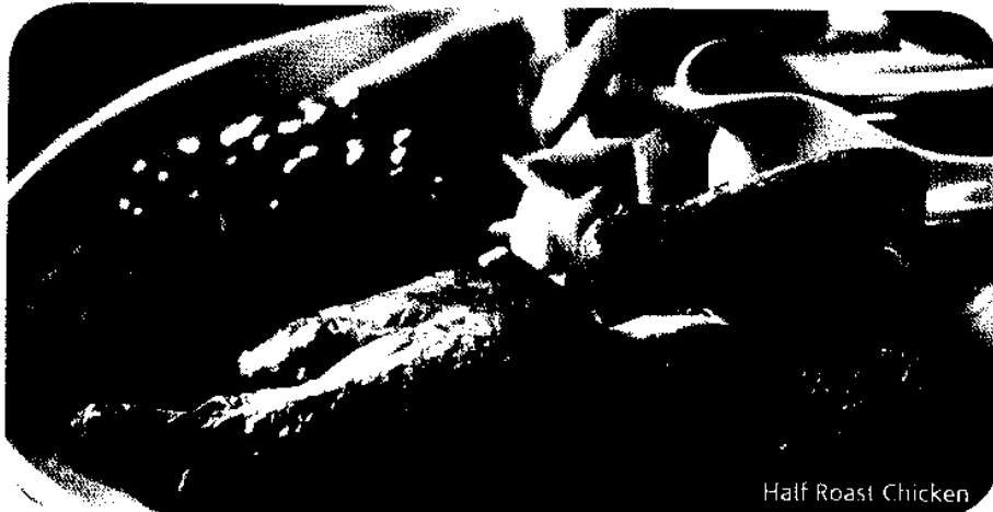
Half Roast Chicken